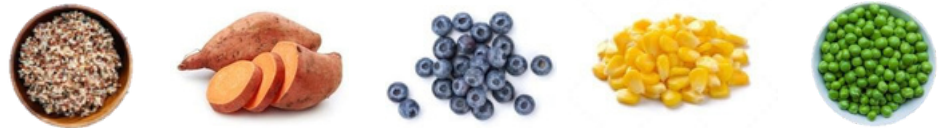
Quinoa, brown or wild rice, farro, barley, potatoes, yams, winter squash, corn, peas, mango, apples, berries, citrus segments, pomegranate seeds

Add filling fiber with whole grains, starchy vegetables, and/or fruit, ½ cup