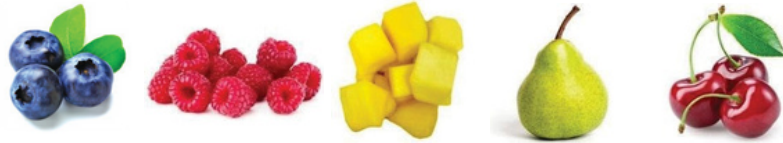
Blueberry, strawberry, raspberry, pear, pineapple, banana, apple, mango, cherries, peaches, etc.