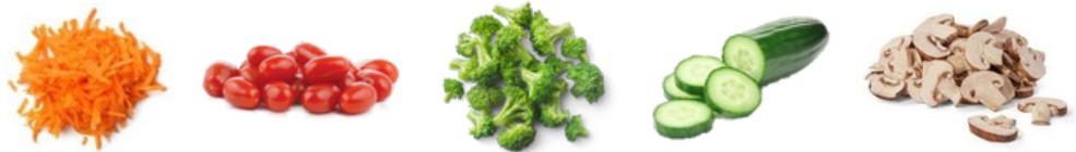
Artichoke hearts, asparagus, bell peppers, broccoli, carrots, cauliflower, cucumber, microgreens, mushrooms, onion, snap peas, summer squash, tomatoes, etc.

Add texture and color with a variety of vegetables, raw, steamed or roasted, unlimited