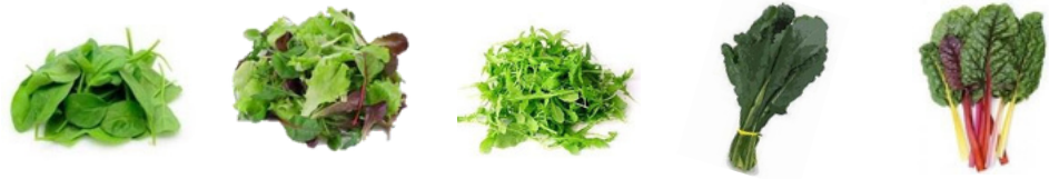
Baby spinach, chopped kale, Swiss chard, arugula, shredded cabbage, lettuce, spring mix, shaved Brussels sprouts, etc.

Start with a hefty base of leafy greens, 2 to 3 cups