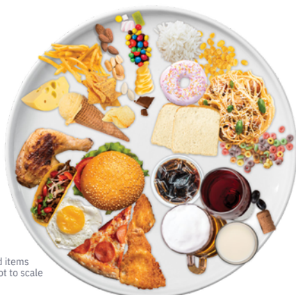
*Food items are not to scale

Decrease sweets and snacks, fast food, fried foods, refined grains, refined sugar, meat, dairy, eggs, poultry, high sodium foods