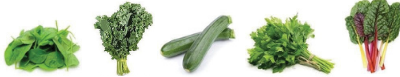
Spinach, kale, Swiss chard, arugula, parsley, cilantro (free to add other veggies like cauliflower, zucchini, carrots, beets or pumpkin)