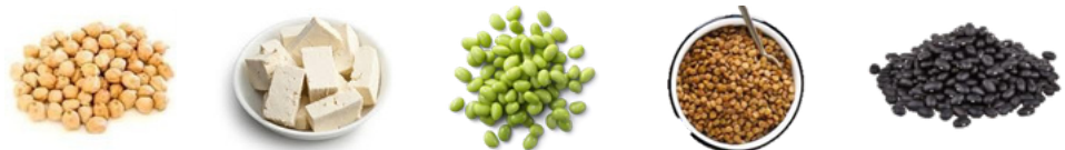
Chickpeas, black beans, kidney beans, white beans, green peas, lentils, edamame, organic tofu, organic tempeh

Add hearty plant protein with beans and legumes, ½ cup