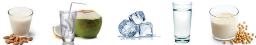
Filtered water, unsweetened plant milk (soy, pea, almond, cashew, oat, rice), unsweetened coconut water, green tea, ice for thickness