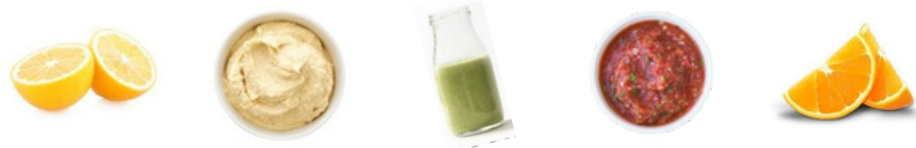
A squeeze of lemon, lime or orange juice, guacamole, balsamic vinegar, white wine vinegar, salsa, hummus, oil-free dressing

Add flavor with a squeeze of citrus, a dollop of dip, or a drizzle of dressing