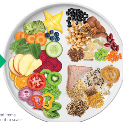
*Food items are not to scale