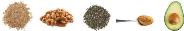
Flax meal, chia seeds, walnuts, avocado, nut butter