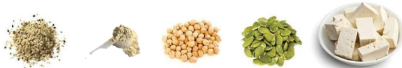
Hemp seeds (2-3 Tbsp), plant-based protein powder (1/2-1 scoop) organic silken tofu (1/2 cup), white beans or chickpeas (1/2 cup), unsweetened soy or pea milk (1 cup, counts as liquid too)